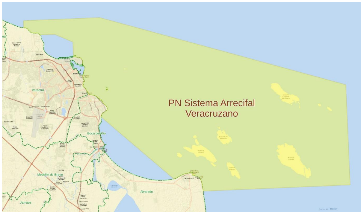
Figure 2.- Boundaries of the Protected Area modified by decree in 2012, Parque Nacional Sistema Arrecifal Veracruzano.

On November 13, 2013, the General Direction of Environmental Impact and Risk (DGIRA, by its acronym in Spanish) of the Secretariat of Environment and Natural Resources of Mexico (SEMARNAT, by its acronym in Spanish) granted authorisation for the project titled “ Ampliación del Puerto de Veracruz en la Zona Norte ”, to the formerly called the Integral Port Administration of Veracruz, SA de CV (APIVER), currently Administration of the National Port System Veracruz (ASIPONA), a parastatal body of the Secretariat of the Navy. This authorisation was conditioned on the implementation of a series of measures to mitigate or compensate for the adverse environmental impacts of the project at each stage of its development (site preparation, construction, operation, and maintenance).