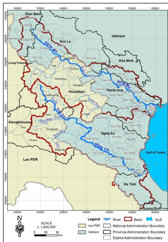
Figure 1: Map of the two river basins. Note: some important tributaries are not shown.

The Results Framework of the project specifies project's Output 2.3 as: Harmonized design of multi-purpose monitoring networks, and joint monitoring and data-sharing protocols. To work towards achieving this output, first the project will conduct an assessment of the current monitoring networks . This assignment concerns that specific task, in Viet Nam, for the two river systems, their tributaries and the relevant parts of the coastal zone.